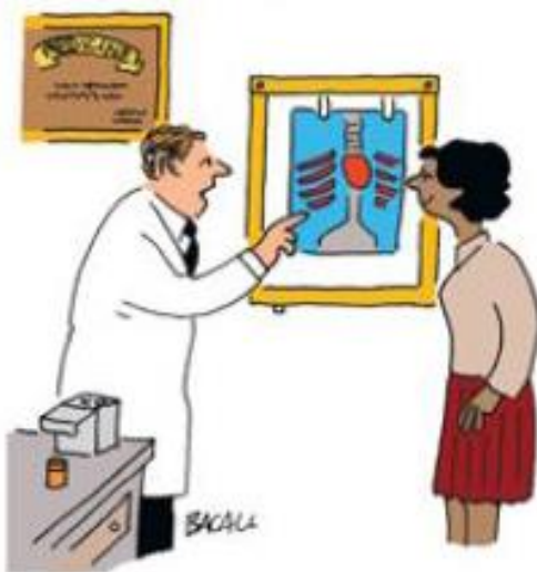
“Your heart is slightly bigger than the average human heart, but that’s because you’re a teacher.”