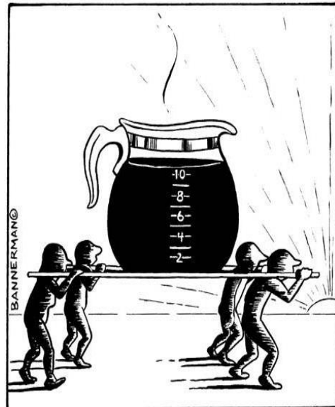
Hi-Ho, Hi-Ho, it's off to work we go.